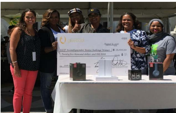
The principal receiving a $25,000 check from Oakland Natives Give Back during their annual Back to School Rally.