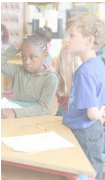
QUALITY COMMUNITY SCHOOLS

We will measure the effectiveness of central services to ensure that student needs are put first and schools receive the support they need to be successful. We will engage in cycles of inquiry to elevate exemplary services and to improve our supports to our stakeholders.