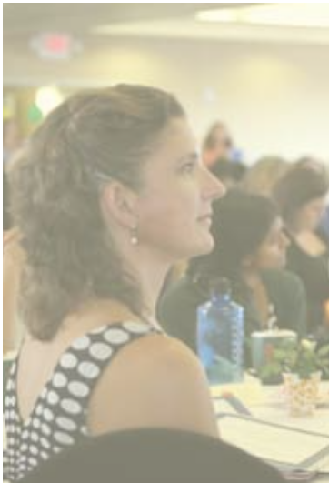
ACCOUNTABLE SCHOOL DISTRICT

We will create professional growth opportunities that facilitate the development of all employees as educators and leaders within our system in a way that supports the placement and retention of our effective employees.