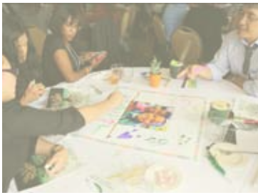
EFFECTIVE TALENT PROGRAMS